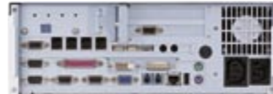
▲ Advanced connectivity

TOSHIBA TEC delivers new features in the ST-7000 which are designed to lower the total cost of ownership (TCO). Retailers can utilise and protect their investment in existing PoS peripherals and with powered USB available, have a 'future-proof' hardware platform to cater for the ever changing needs of the retail business. The system is designed for easy installation, requiring just a single power outlet. The new powered USB ports make it easy to connect or replace PoS peripherals and the slide out modules (SOM) are designed to minimise down-time, reduce the overall cost of maintenance and improve checkout productivity.